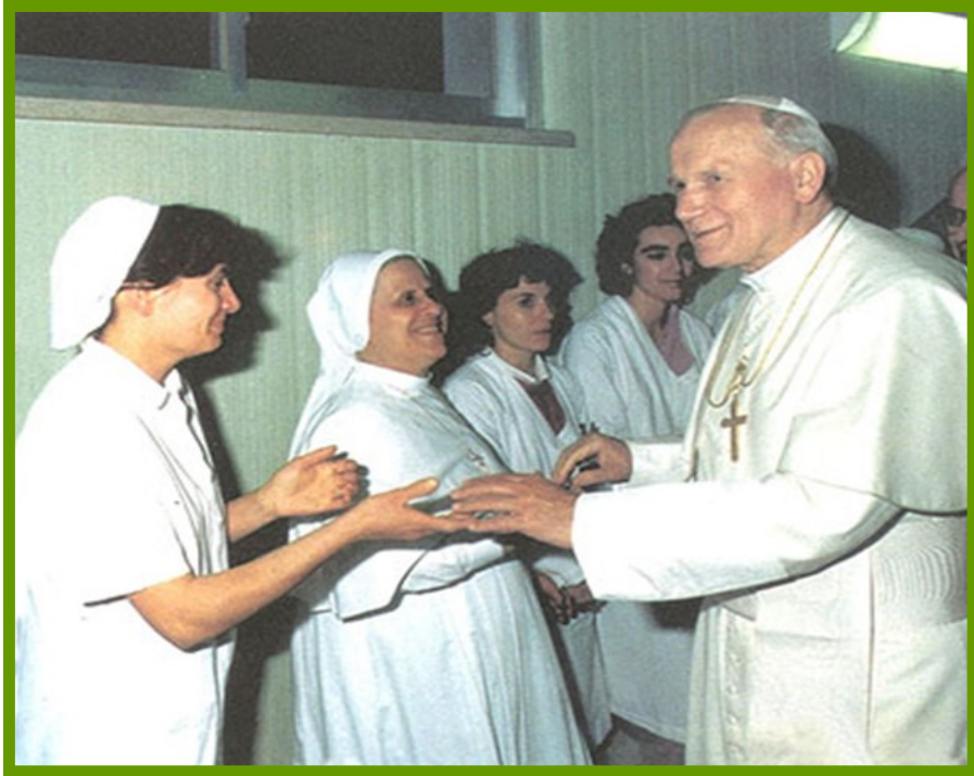
Pope John Paul II greets staff on a visit to Padre Pio's hospital, the Home for the Relief of Suffering in 1987.