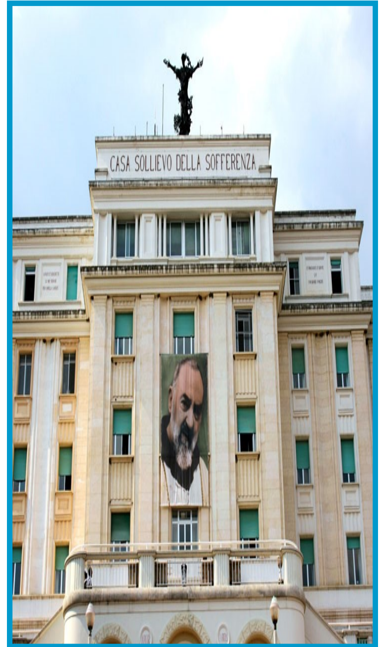
Padre Pio's Home for the Relief of Suffering