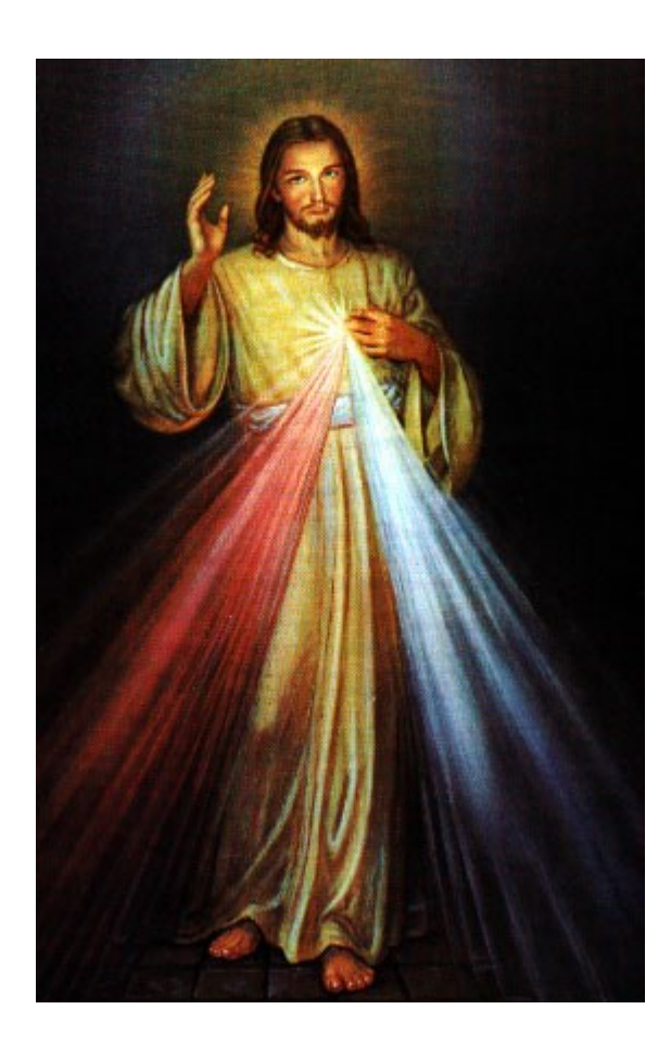
To suffer humiliation is painful, but you may be sure that Divine Mercy will turn it into your consolation.