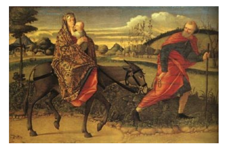
Flight To Egypt

*(Excerpted from: www.traditioninaction.org)