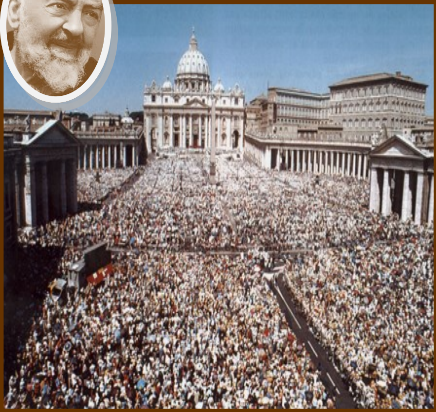
JUNE 16, 2002—THE CANONIZATION OF PADRE PIO AT THE VATICAN

PLEASE VISIT THE WEBSITE: www.pamphletstoinspire.com