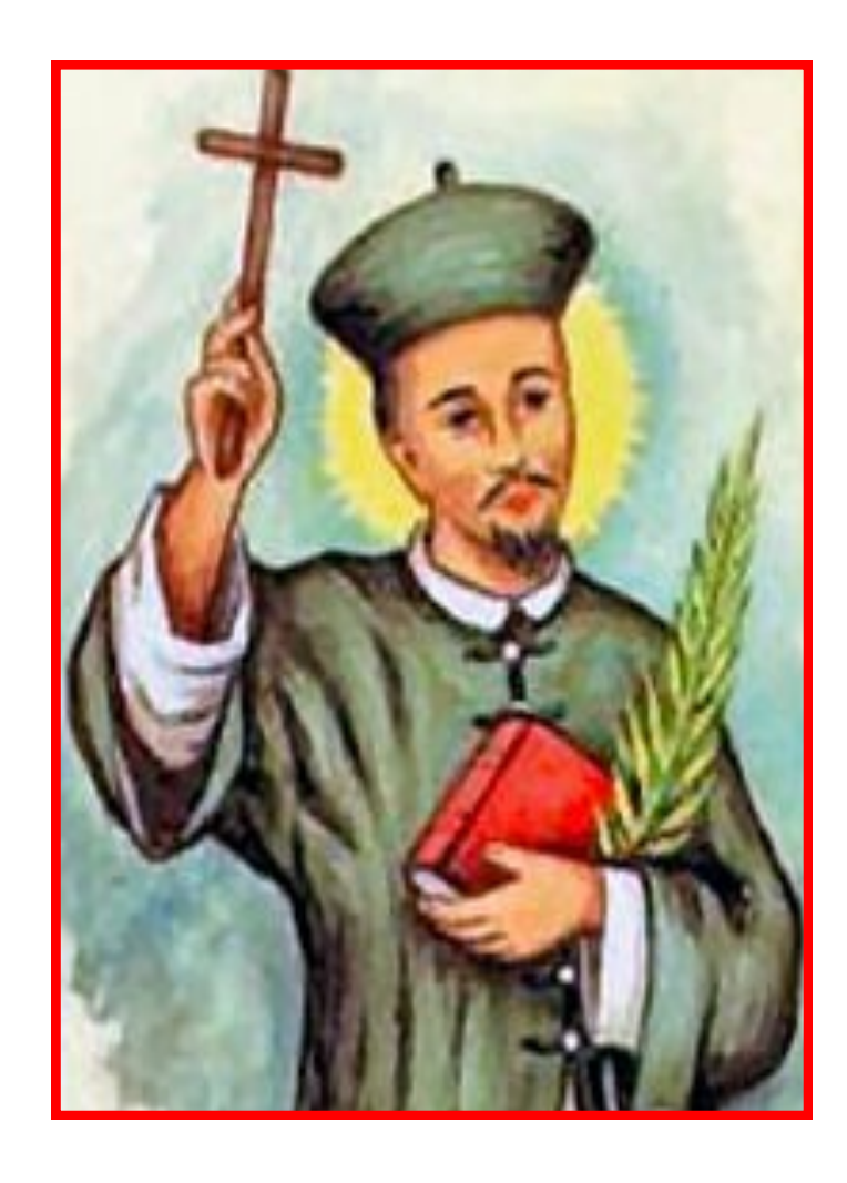
PLEASE VISIT OUR WEBSITE: www.pamphletstoinspire.com