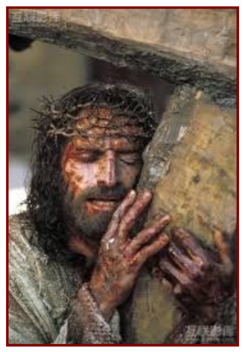
Through your Holy Cross save us!

PLEASE VISIT OUR WEBSITE: www.pamphletstoinspire.com