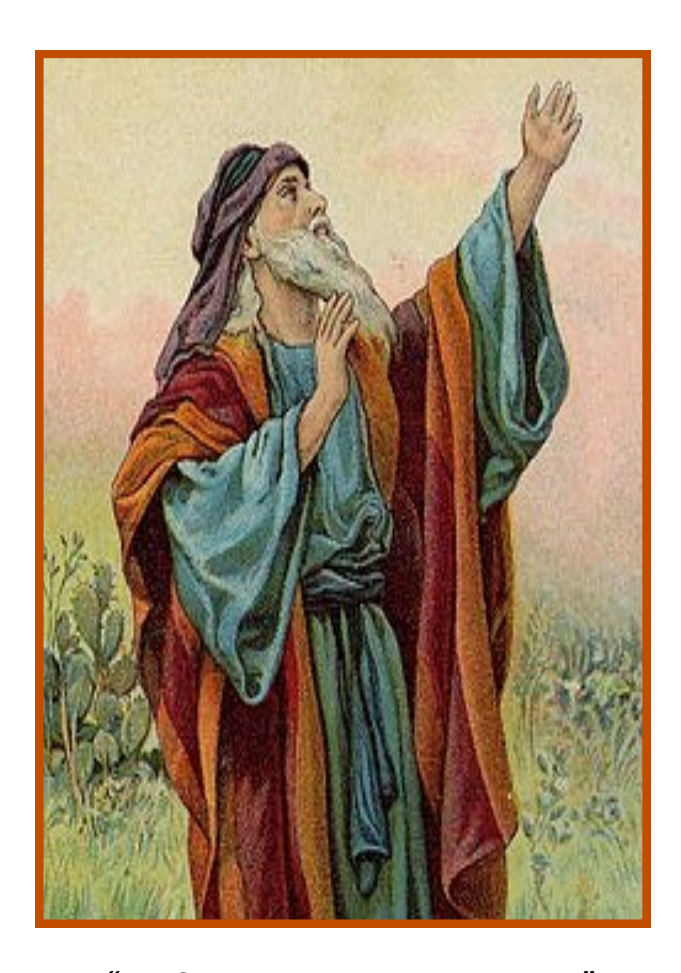
"THE SPIRIT OF THE LORD IS UPON ME" ISAIAH 61:1