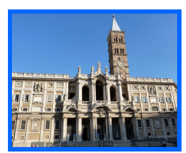
Basilica di Santa Maria Maggiore

*(excerpted from: www.praytherosaryapostolate.com)