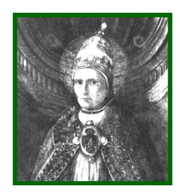
Pope Saint Victor I