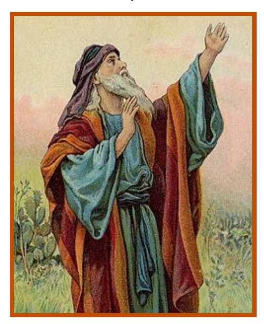
"THE SPIRIT OF THE LORD IS UPON ME" ISAIAH 61:1

PLEASE VISIT OUR WEBSITE: www.pamphletstoinspire.com