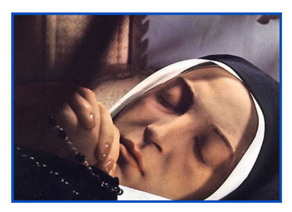
INCORRUPT BODY OF SAINT BERNADETTE SOUBIROUS NEVERS, FRANCE

*(excerpted from: www.traditionalcatholicpriest.com)