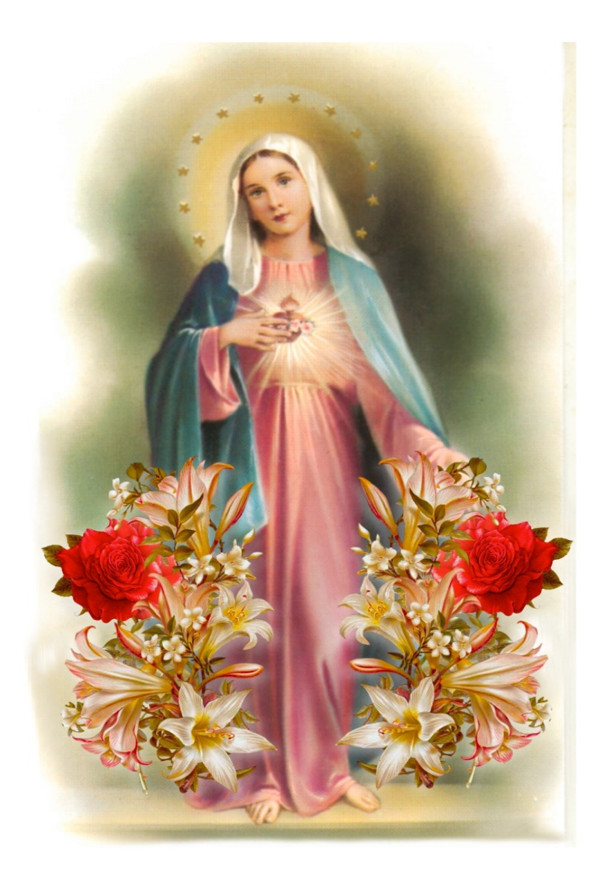
PLEASE VISIT THE WEBSITE: www.pamphletstoinspire.com