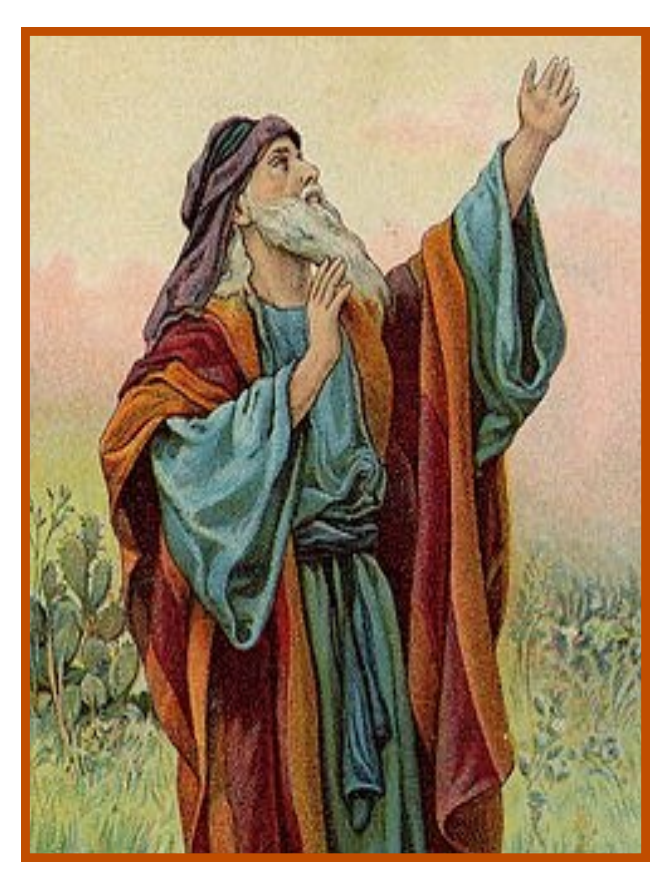
"THE SPIRIT OF THE LORD IS UPON ME" ISAIAH 61:1