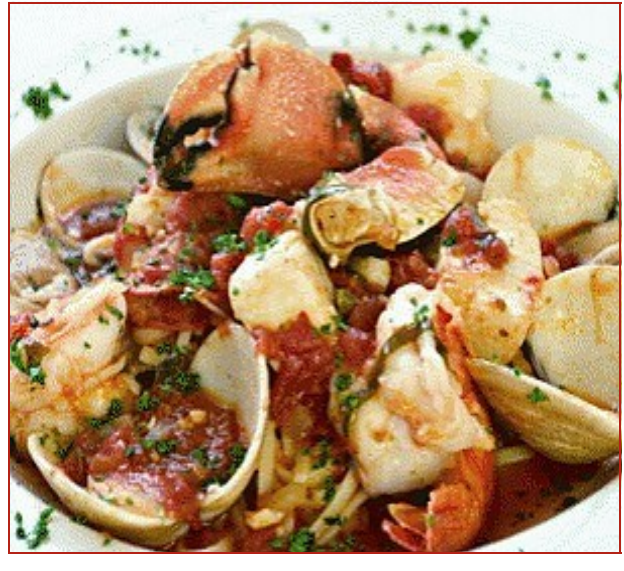
PLEASE VIST OUR WEBSITE: www.pamphletstoinspire.com

AN OLD ITALIAN FAVORITE: CIOPPINO (fish stew)