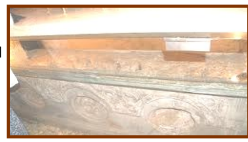
Tomb of Blessed Mother on Mount Olivet Site of the Assumption

about you by the Lord is fulfilled by your beautiful death, and made perfect in every way.