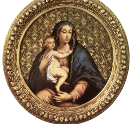
Our Lady of Purity Image in Padre Pio's cell

St. Peter's Basilica on the feast day of Our Lady of Fatima, October 13, 1958. The Congregation for the Cause of Saints at the Vatican issued a decree which was approved by Pope Benedict XVI in 2009. The decree gave its stamp of approval to the heroic virtues in the life of Pope Pius XII and the title of "Venerable" was then added to his name.