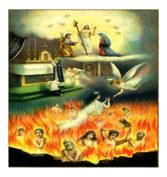
By our prayers a released soul sweeps upward toward God!

We can have part in that swift flight to joy if we pray: (say prayer for the Holy Souls)