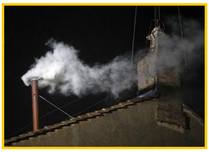
Smoke Signal at the Vatican when a New Pope has been elected

O God, eternal shepherd, who govern your flock with unfailing care, grant in your boundless fatherly love a pastor for your Church who will please you by his holiness and to us show watchful care. Through our Lord Jesus Christ, your Son, who lives and reigns with you in the unity of the Holy Spirit, one God for ever and ever. Amen.