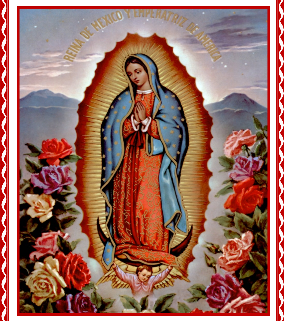
Feast Day—December 12th