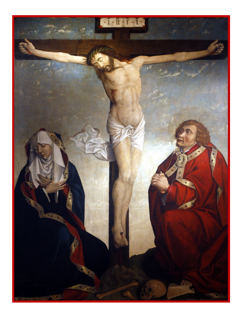
PLEASE VISIT OUR WEBSITE: www.pamphletstoinspire.com

gladness is only sorrow; all other pleasantness is pain, all sweetness bitter, all beauty but as ugliness." And elsewhere he says, "A sure sign of the indwelling of the Holy Ghost in the soul is spiritual joy." For the soul which exults in God exults because God inhabits it.