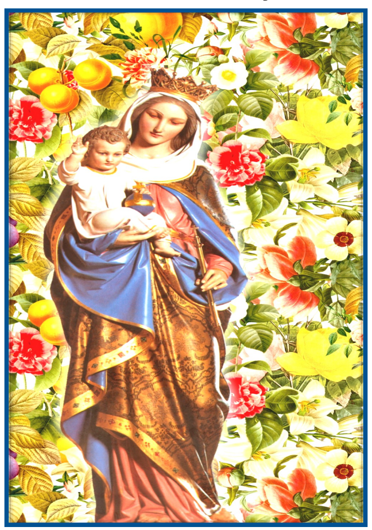
In Honor of the Power, Wisdom and Loving Mercy of the Blessed Virgin Mary!