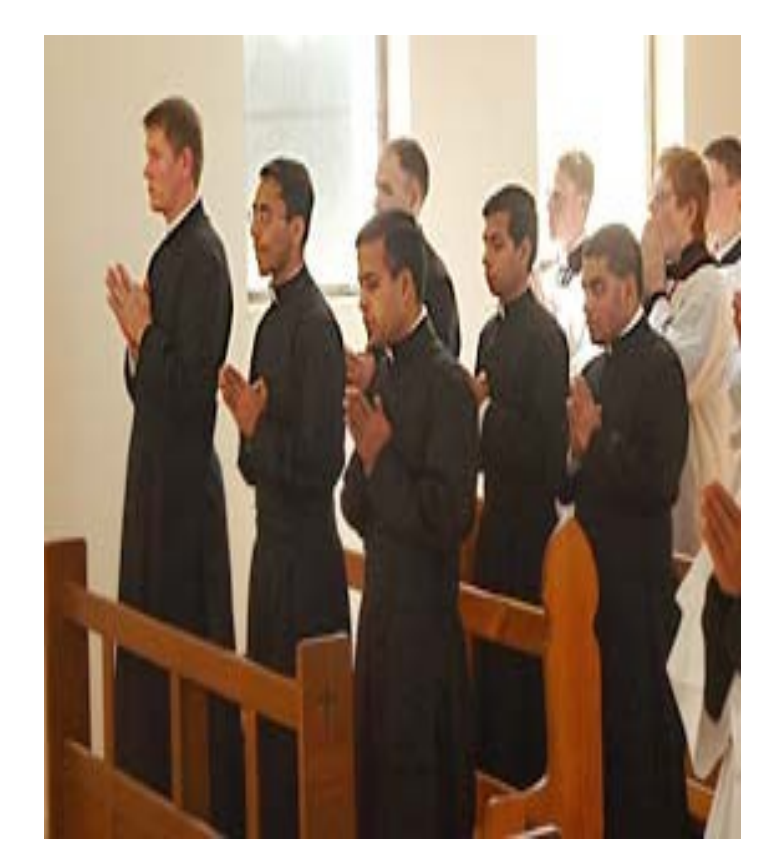
PRAY FOR OUR SEMINARIANS