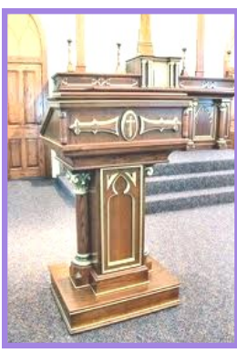
PLEASE VISIT OUR WEBSITE: www.pamphletstoinspire.com