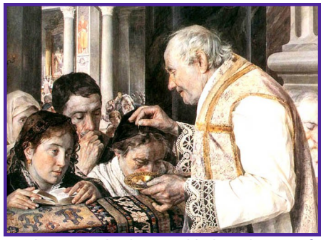
Ashes may also be sprinkled on the top of the head as shown in this 1881 Polish painting.