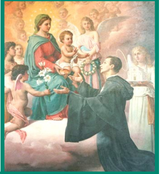
Vision that St. Nicholas had of the Blessed Mother handing him a bit of bread; the Infant Jesus was holding a chalice filled with water; upon consuming the bread and water he was healed.

and long periods of the day devoted to communal and private prayer. As Nicholas entered the Order at its inception he learned to combine the ascetical practices of the Brettini with the apostolic thrust which the Church now invited the Augustinians to practice. At times, Nicholas devoted himself to prayer and works of penance with such intensity that it was necessary for his superiors to impose limitations on him. At one point he was so weakened through fasting that he was encouraged in a vision of Mary and the child Jesus to eat a piece of bread signed with the cross and soaked in water to regain his strength.