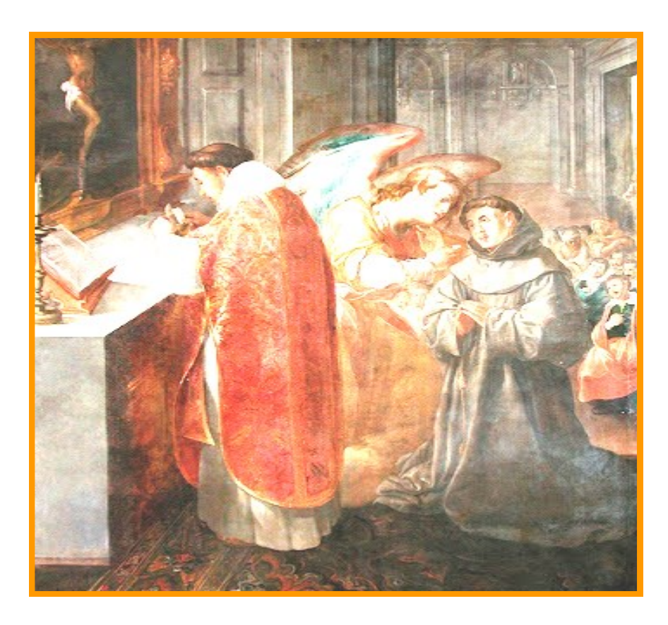
SAINT BONAVENTURE RECEIVING COMMUNION FROM AN ANGEL

Angels love the Holy Latin Mass because, as they do, it puts adoration of God first and protects His Almighty dignity. Let us traditional Catholics be thankful for the angels and imitate them by loving, adoring and protecting Jesus in the Blessed Sacrament of the Altar.