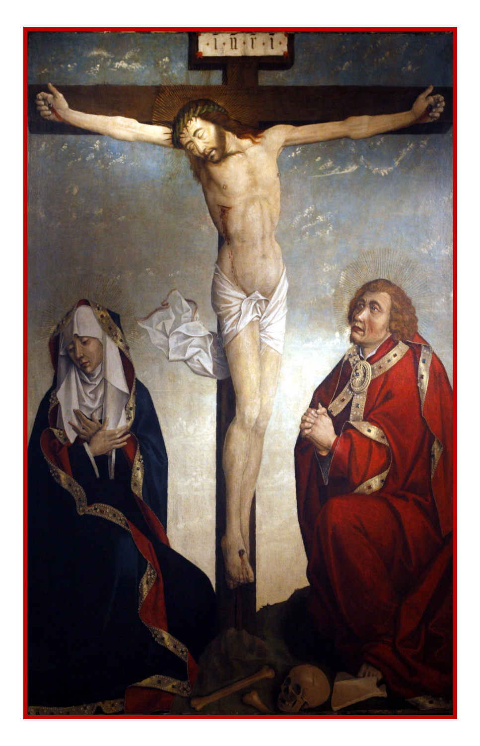
PLEASE VISIT OUR WEBSITE: www.pamphletstoinspire.com